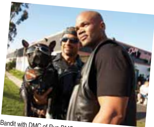
Bandit with DMC of Run DMC