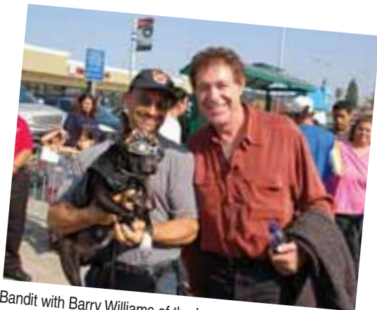
Bandit with Barry Williams of the brady bunch