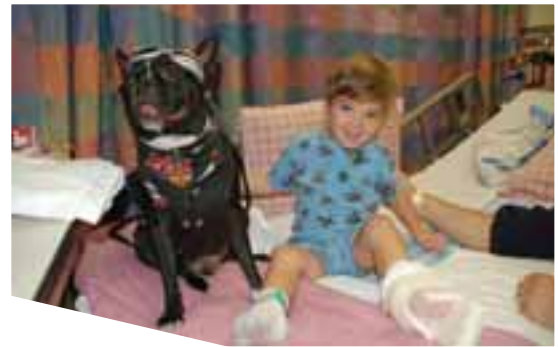
Bandit and a friend!