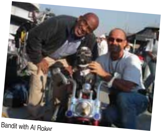
Bandit with Al Roker