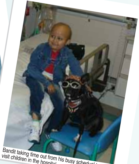
Bandit taking time out from his busy schedual to visit children in the hospital