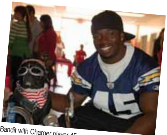
Bandit with Charger player 45