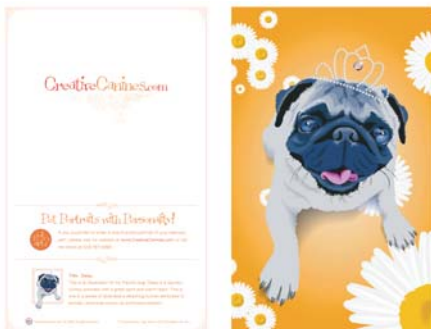
DAISY CUSTOM GREETING CARD